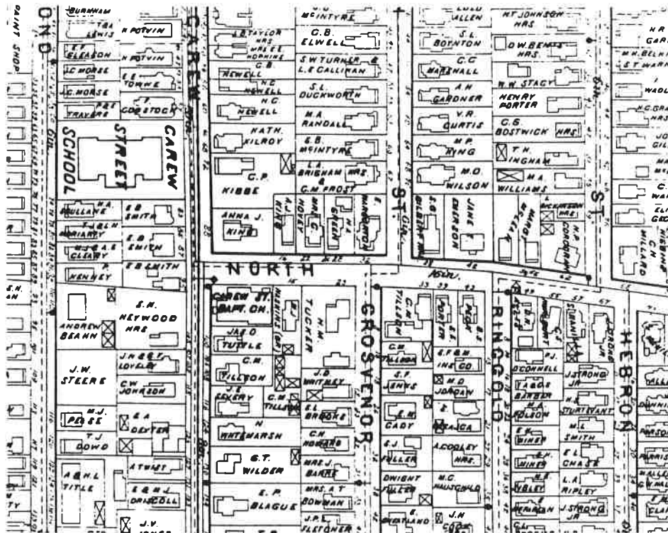
1899 Atlas of the City of Springfield - plate 3

all of Springfield covered; streets with names & numbers, lot lines, building outlines with differentiation for construction material, owners' names, electric railway lines, fire alarms, hydrants, sewers