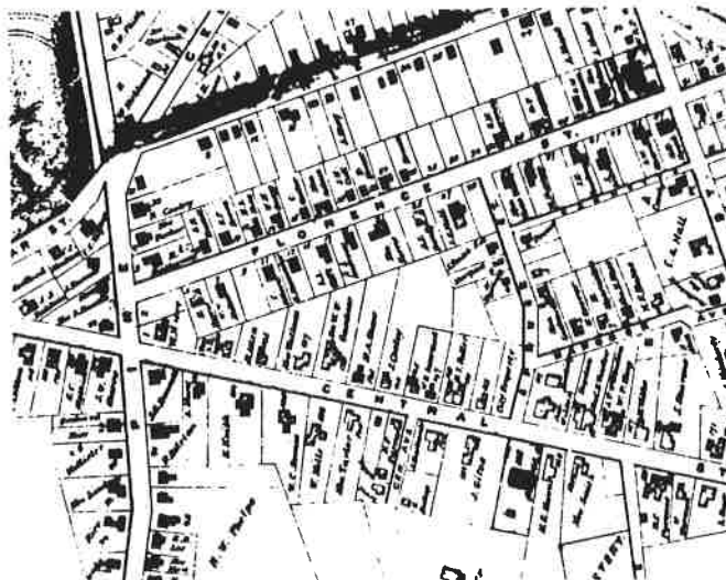
1870 Map of the City of Springfield